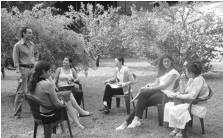
One favorite question: "Is it an American custom to have parties in a cemetery?"

For the third year in a row, the Greater New York Chapter of the Fulbright Association , in partnership with Metro International , held their annual open air cocktail party in our garden on a warm summer evening in early September. The foreign students, scholars, and their NYC hosts enjoyed refreshments, networking and a short history lesson on their unusual surroundings.