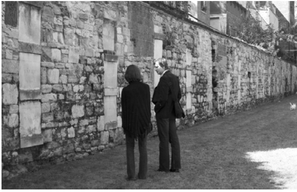
The South Wall of the Cemetery.

We are currently undertaking a major effort to strengthen and stabilize the base of the South Wall, repair problem areas, and erect a perimeter enclosure along our property lines where the wall needs future restoration; first along the West Wall and then along the North Wall as the City Department of Building contractors remove their scaffolding. The temporary fence will restore our historic enclosure and close gaps to prevent incursions onto the Cemetery grounds.