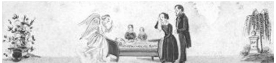
Memorial for a Dead Child, mid-nineteenth century watercolor. (Wellcome Trust #L0043624, detail)

Germ theory was just beginning, with the recognition that microorganisms, rather than miasmas and spon-