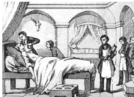
Administering chloroform prior to surgery in the mid-nineteenth century.

aneous generation, were largely the causes of contagion. Doctors do not have a single entry in our registers for unknown , yet that must have been the case, at times, since symptoms (indigestion, prostration) or the age of the patient (teething, old age) were noted instead.