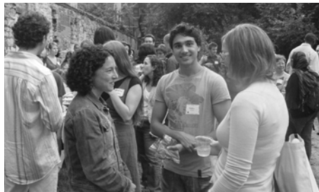
Foreign students and Fulbright scholars enjoy a late summer day in the garden.

Trustees from NYMC presented our Portrait Collection at a day long seminar on Archive Preservation hosted by the Lower Hudson Conference of Historical Agencies and Museums . The presentation of our photo display boards and the detailed techniques for gathering, preserving, and displaying ancestor images was warmly received by our fellow historians.