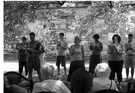
Peculiar Works Project presents an afternoon of play readings, "Rites and Rituals."

On one of the hottest days of the summer the Peculiar Works Project , an off-off-off Broadway theater group sponsored an afternoon series of play readings in NYMC called, appropriately, "Rites and Rituals" which explored different cultural approaches to Death, Afterlife, Embalming, and Memories. More than 20 actors circled among the audience sitting on chairs in the shade of the Mulberry Tree honoring the "Bones beneath Our Feet" with their very lively performances.